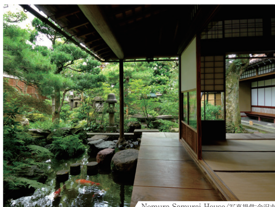
Nomura Samurai House